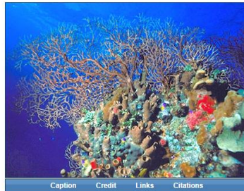
Belize Barrier Reef: sea fan

Mouse over the caption, credit, or links to learn more.